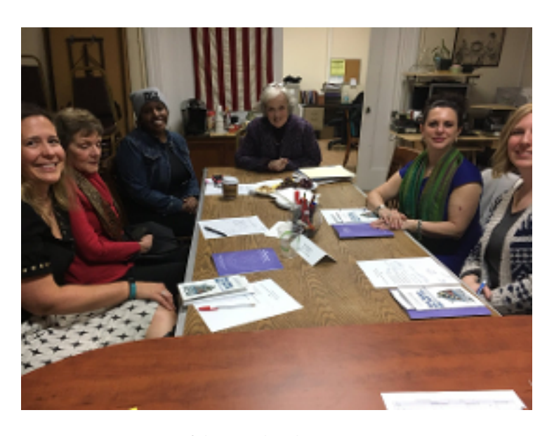
A meeting of the Membership Committee.

Check the link on our website where you may submit questions you would like asked of candidates running for City Council and Borough President. We will need League members to assist that evening and members who reside in the district or want to attend should email the office.